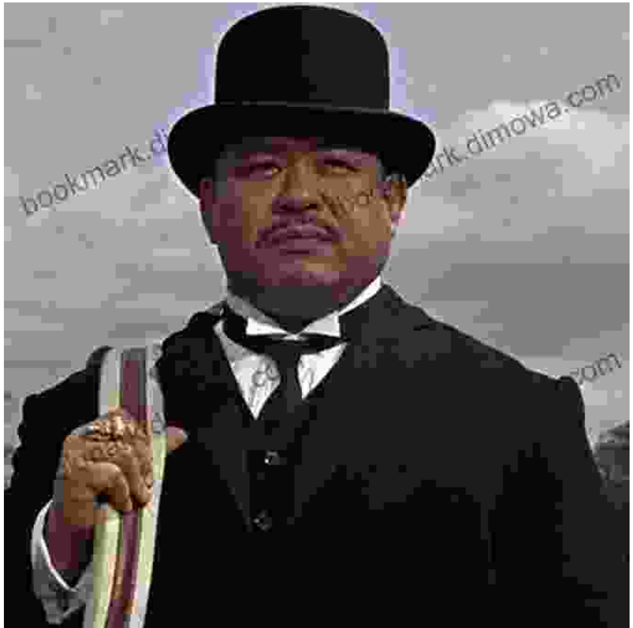
Harold Sakata as Oddjob in Goldfinger