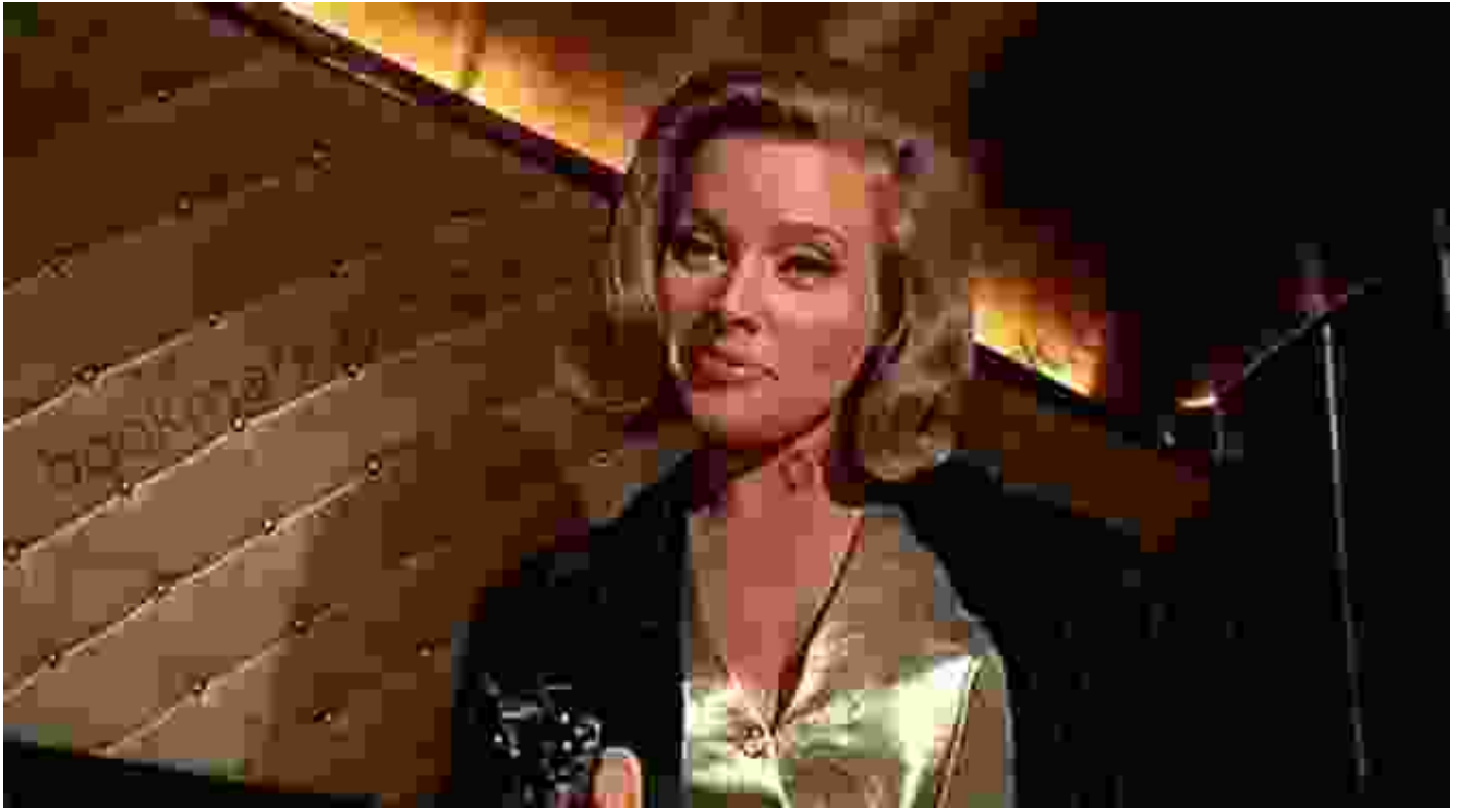
Honor Blackman as Pussy Galore in Goldfinger