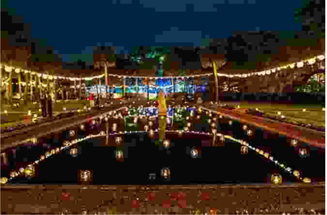
Parade of the Thousand Candles