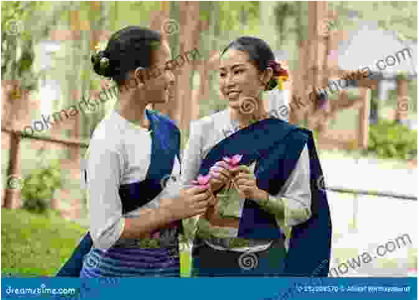
Women in traditional dress at a market

The written monologues that accompany the photographs provide context and insight, sharing personal stories, cultural traditions, and historical anecdotes. Together, the images and words create a vivid and immersive experience, allowing readers to connect with people from different cultures and gain a deeper understanding of our shared humanity.