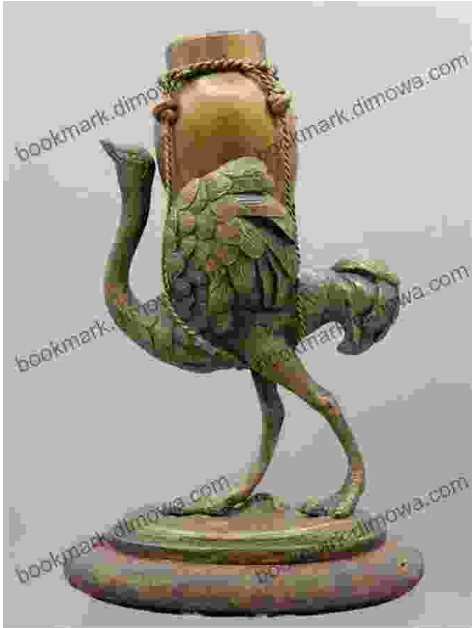
Detail of Raphael Ostrich