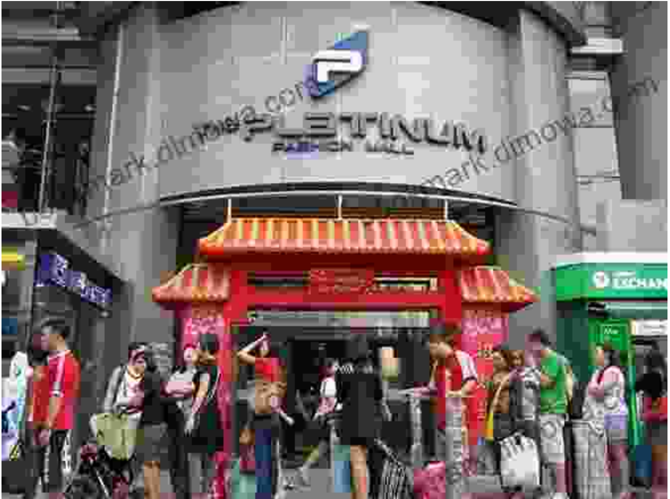
Platinum Fashion Mall

Platinum Fashion Mall is a wholesale and retail shopping mall specializing in fashion. It's home to over 2,000 stores, selling a wide range of clothing, accessories, and shoes. The mall also has a large food court and a cinema complex.