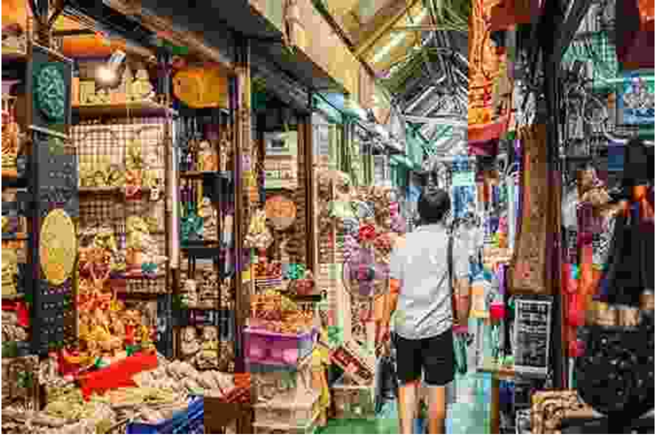
Chatuchak Weekend Market

Chatuchak Weekend Market is the largest weekend market in the world. It's home to over 15,000 stalls, selling a wide range of products, including clothing, accessories, souvenirs, and food.