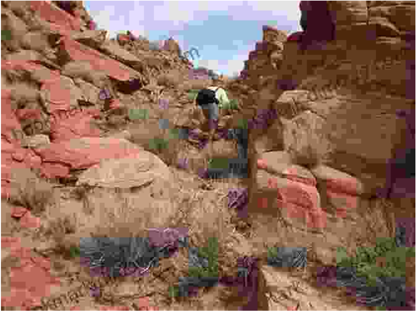
Old Rag Mountain Trail in Summer