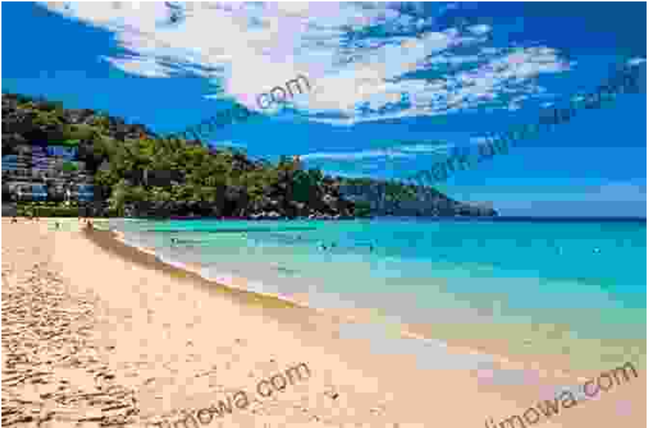
A stunning beach in Phuket, Thailand

The photographs in 'Amazing Thailand Photo For Tourist' are not just beautiful; they are also evocative. Each image captures the essence of Thailand, from the warm smiles of its people to the vibrant colors of its landscapes.