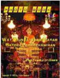
Photo Book Wat Arunratchawararam Ratchaworamahawihan: Wat Arun - The Temple of Dawn The statuesque pagoda of Wat Arun, or The Temple of Dawn, Thailand by Greater Than a Tourist

Wat Arun is a must-see for any visitor to Bangkok. Its beauty and historical significance make it one of the most iconic landmarks in the city. Whether you are a first-time visitor or a seasoned traveler, Wat Arun is sure to leave a lasting impression.